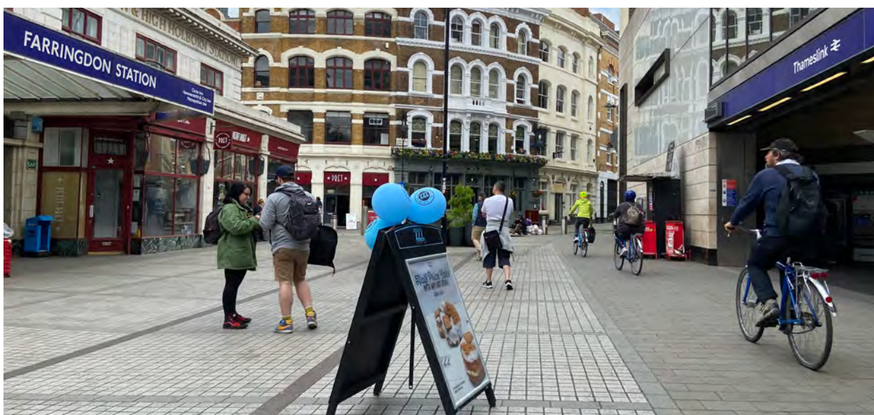
Image Description: The public space between Farringdon Underground exit and Farringdon National Rail Exit, a paved path with people, the camera looking towards Cowcross Street

1. If you are coming out of Farringdon Underground Exit (Metropolitan, Circle or Hammersmith and City) turn left out of the station and continue along the road. If you are coming out of Farringdon National Rail and Thameslink, turn right out of the station and continue along the road. The pavement and roads are flat and can be accessed easily.