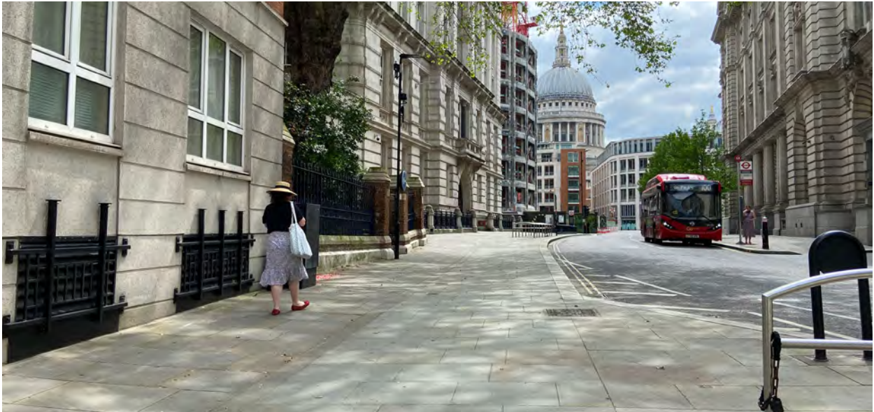
Image Description: A stone building is on the left and road the right, with a wide path straight ahead leading to the entrance to Postmans Park.

7. On your right is a large entrance to St Barts hospital where there are accessible toilets. Opposite the entrance is a crossing, cross here to the other side of the road a go right.