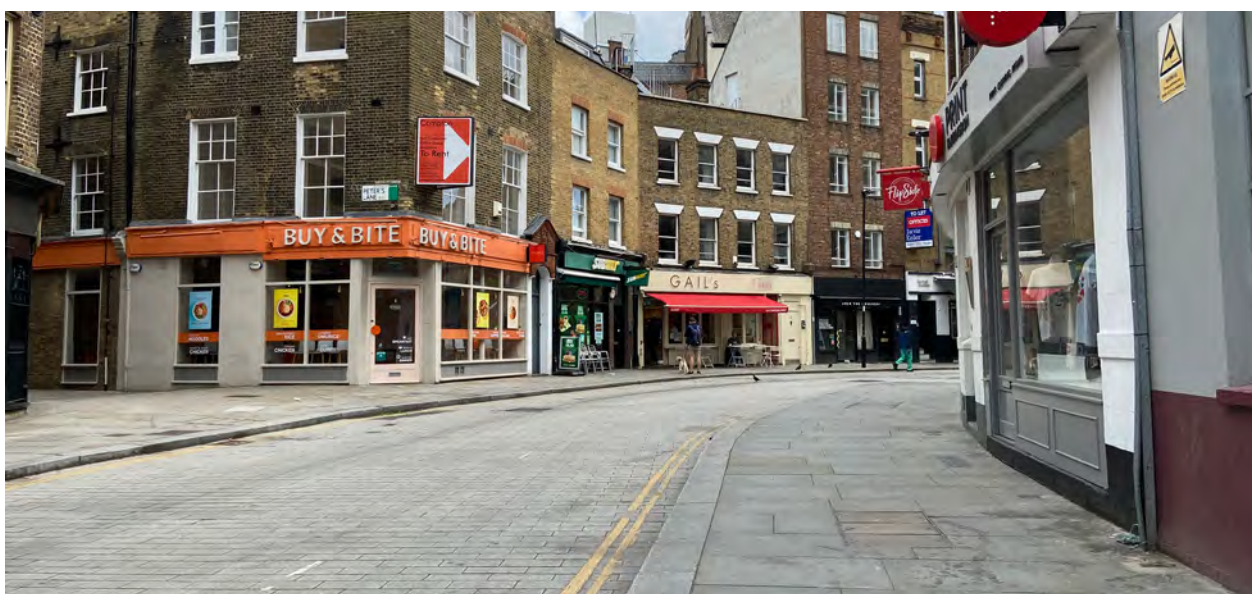
Image Description: Cowcross Street with the road curving round to the right and shops in the background

1. If you are coming out of Farringdon Underground Exit (Metropolitan, Circle or Hammersmith and City) turn left out of the station and continue along the road. If you are coming out of Farringdon National Rail and Thameslink, turn right out of the station and continue along the road. The pavement and roads are flat and can be accessed easily.