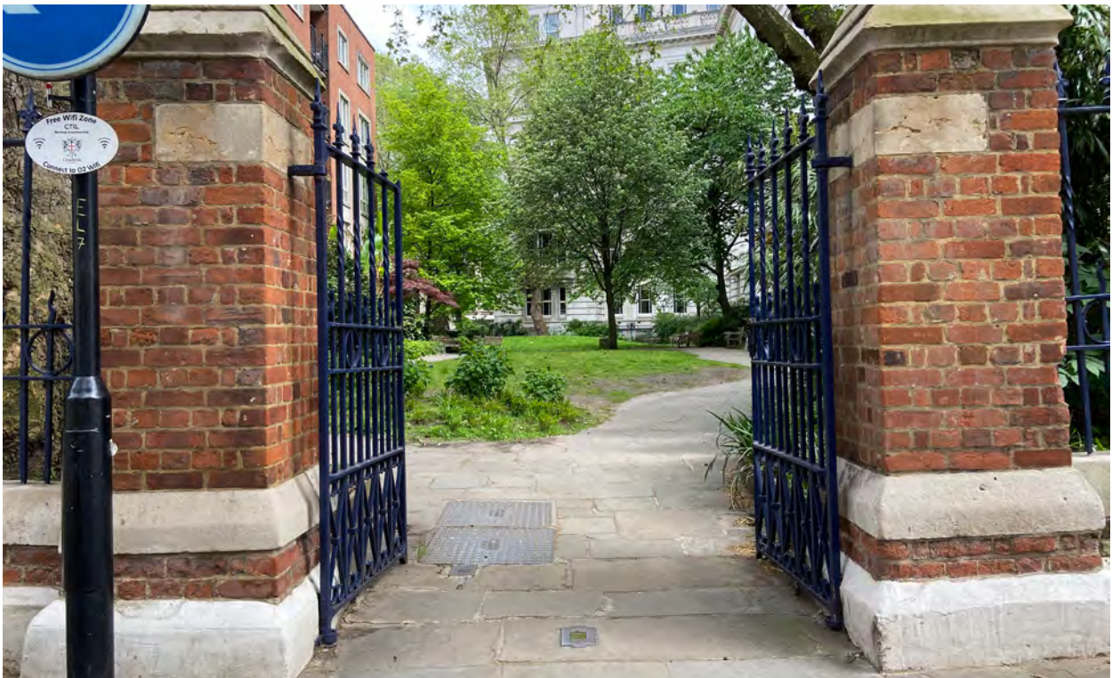
Image Description: Two brick pillars and an open black steel gate lead into Postmans Park.

7. On your right is a large entrance to St Barts hospital where there are accessible toilets. Opposite the entrance is a crossing, cross here to the other side of the road a go right.