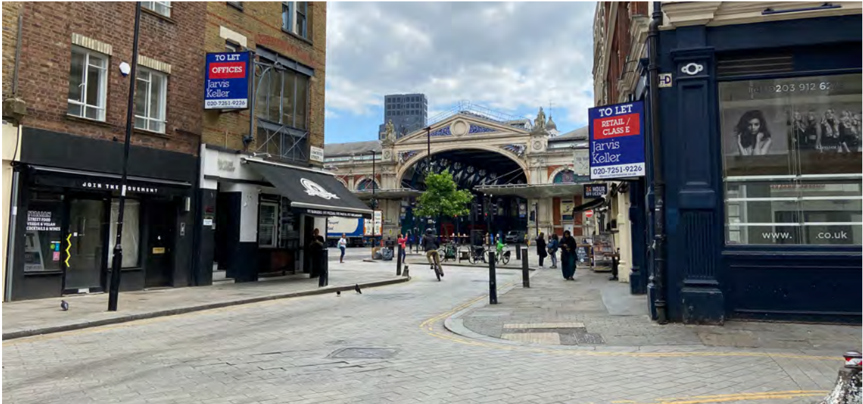
Image Description: Cowcross street turning left into a junction, there are shops either side and Smithfields Market in the background.

3. There is an affordable cafe on your right serving affordable food and drink. The road opens up onto a junction that can be busy and noisy at certain times of day. Cross at the accessible pedestrian crossing and continue along the road that goes through the large market building. This building is Smithfield Market. As an industrial market it is very busy at night but is quiet during the day.