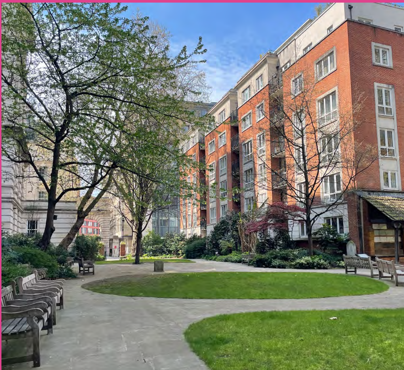
Image Description: Postman's park, concrete winding paths and grassy areas with trees to the left and a 6 story brick building to the right.