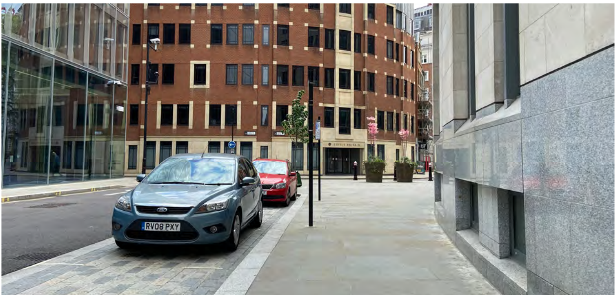
Image Description: A narrow path with parked cars on the left, a tall wall to the right, and a building straight ahead.

5. Continue along the road for about 150 metres. There are a few obstructions on the right side of the street. On your right you will find a few chairs which you may use to rest.