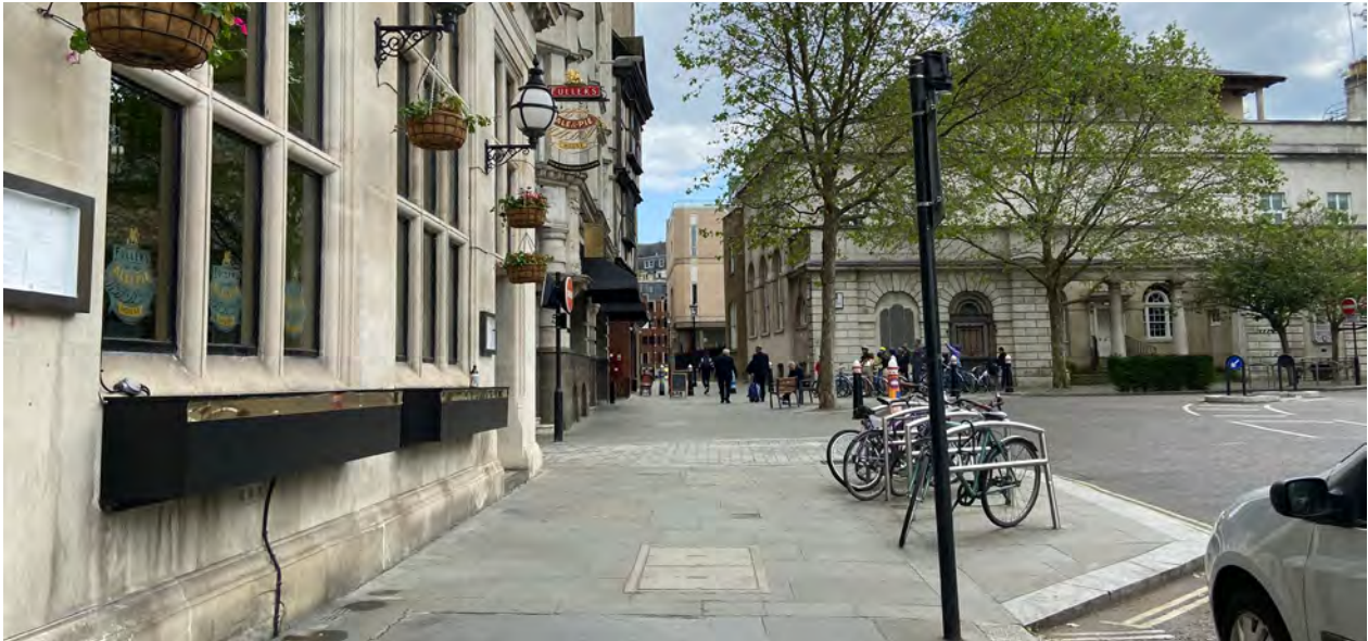
Image Description: A stone building is on the left and a collection of bikes to the right, straight ahead there is a slightly narrower path leading towards St Barts Hospital.

5. Continue along the road for about 150 metres. There are a few obstructions on the right side of the street. On your right you will find a few chairs which you may use to rest.