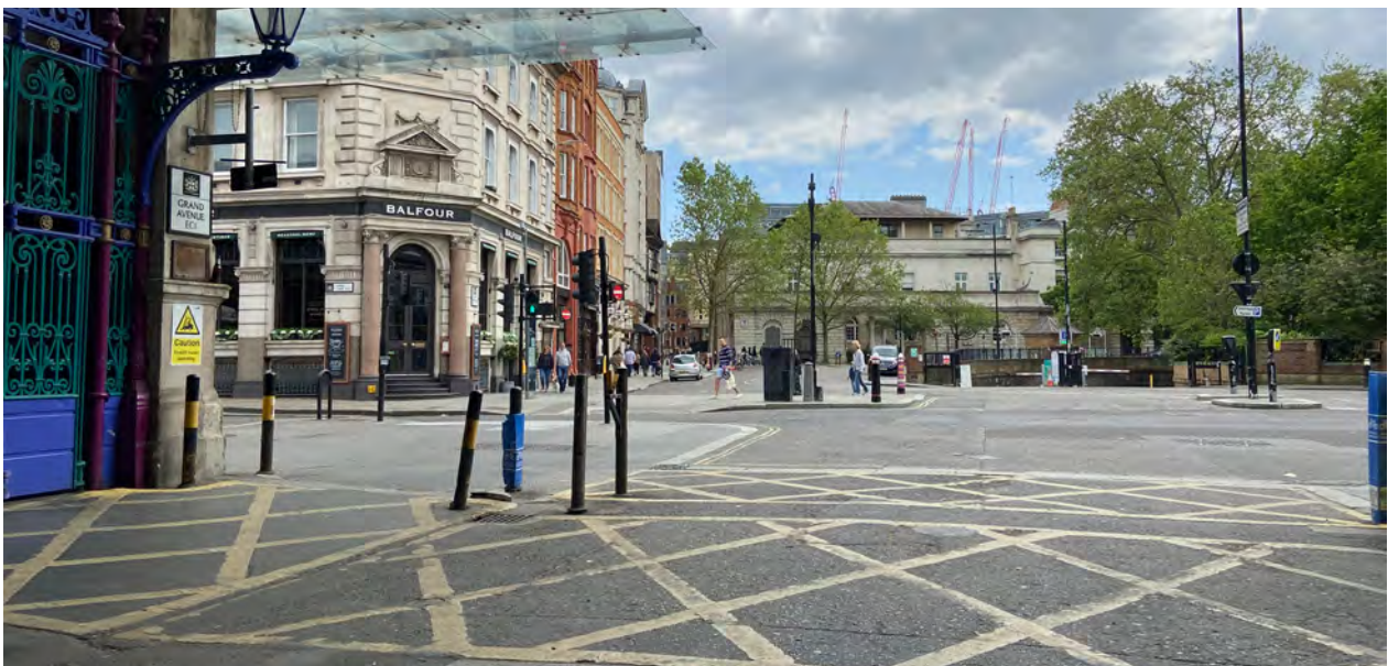
Image Description: The southern end of Smithfields Market, there are several bollards and a crossing to the left. There is a pub on the left and trees in the distance.

3. There is an affordable cafe on your right serving affordable food and drink. The road opens up onto a junction that can be busy and noisy at certain times of day. Cross at the accessible pedestrian crossing and continue along the road that goes through the large market building. This building is Smithfield Market. As an industrial market it is very busy at night but is quiet during the day.