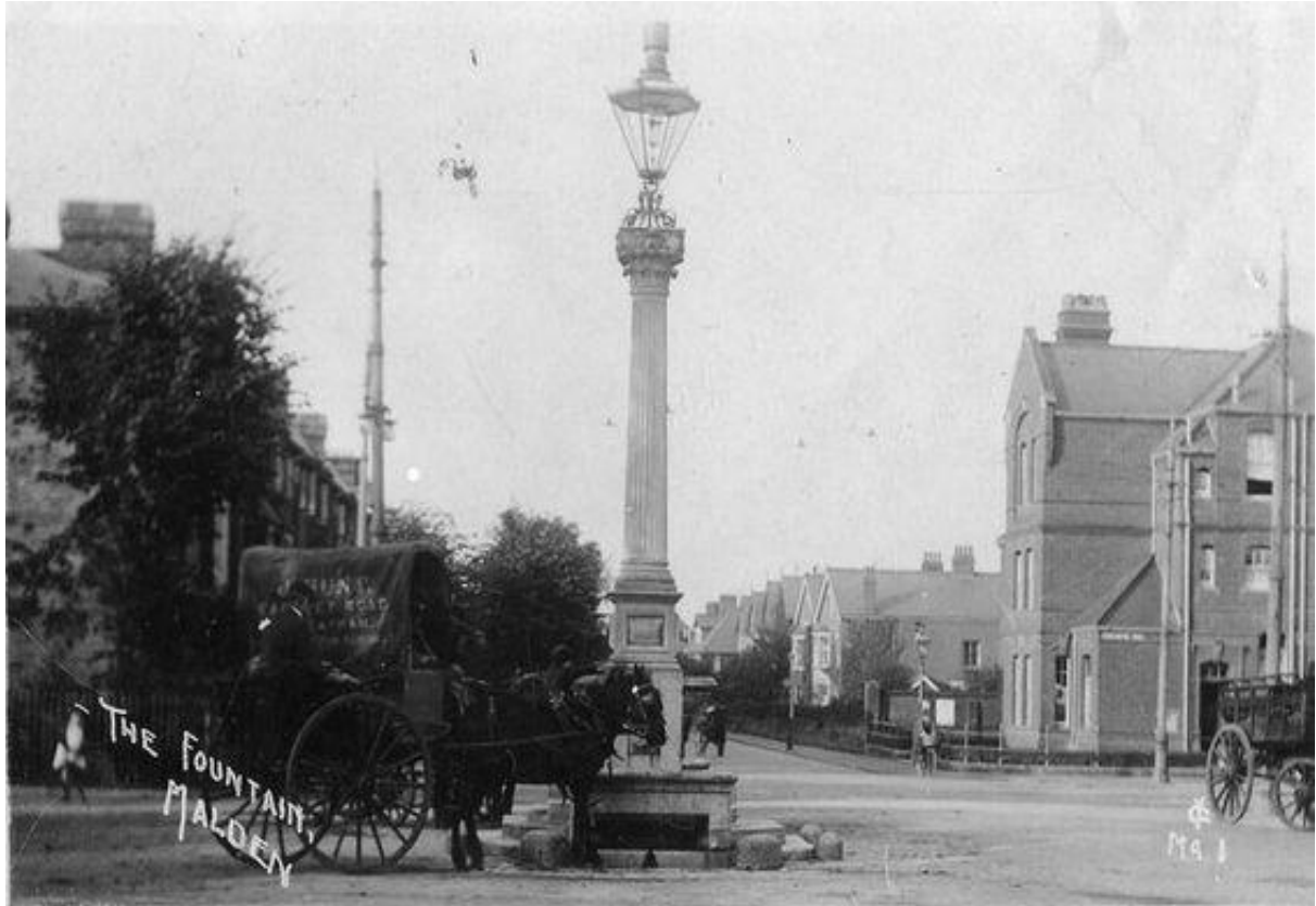
The New Malden Fountain circa 1900-1910