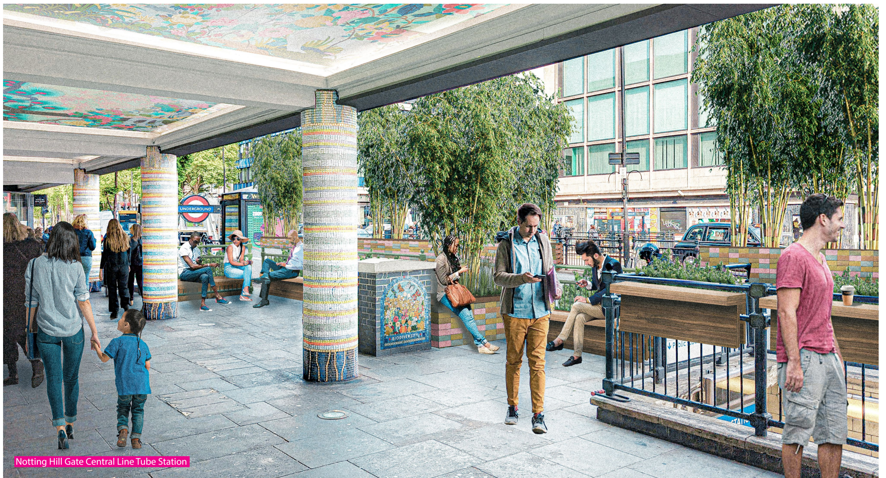
Notting Hill Gate Central Line Tube Station

Turning barriers into green community connectors.