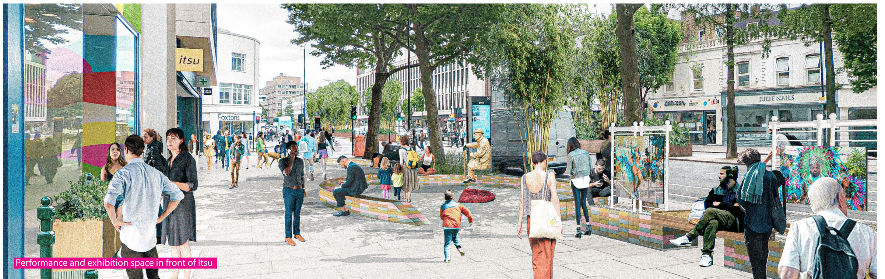
Performance and exhibition space in front of Itsu