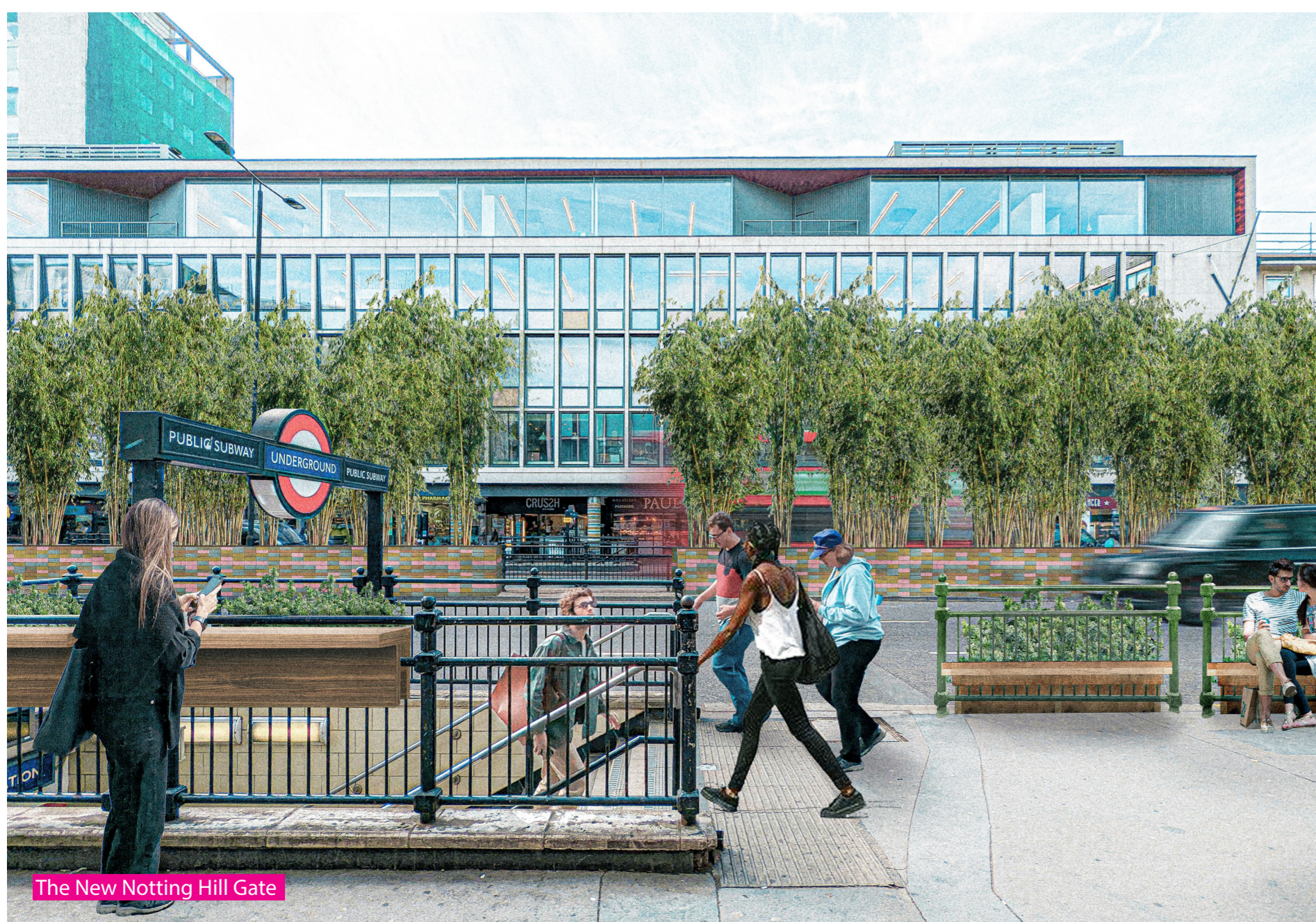
The New Notting Hill Gate