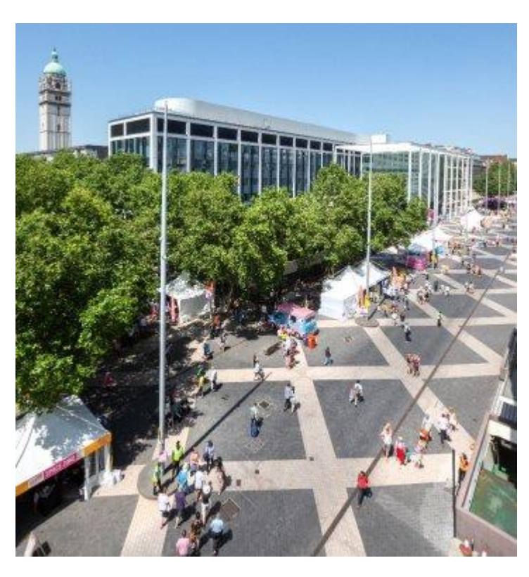
Ariel view of Exhibition Road during Great Exhibition Road Festival 2019.