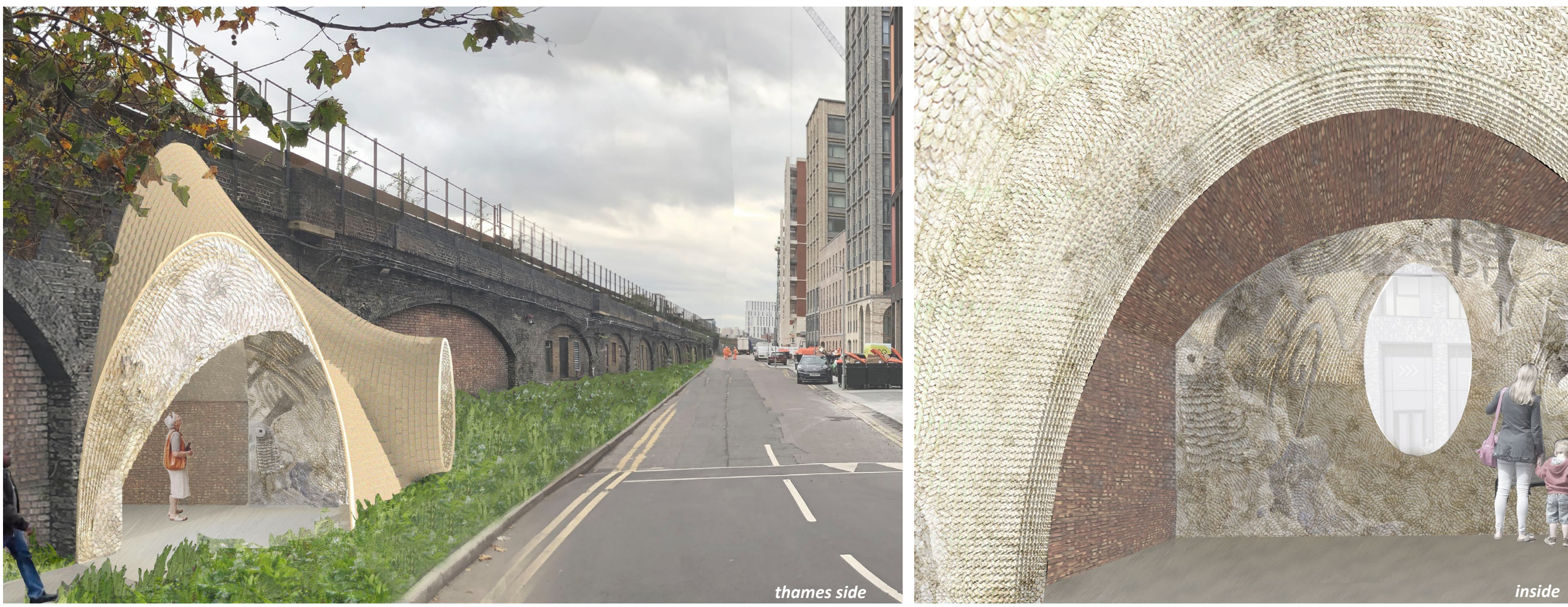
GROTTO 42 is brought to you by FFLO, Local Works Studio, Allt Engineering, and Anna Reading. is a very sustainable structure. It is made from local waste materials mixed and reassembled, a process everyone can enjoy seeing, and learning if they choose, to make a beautiful organic structure from waste.