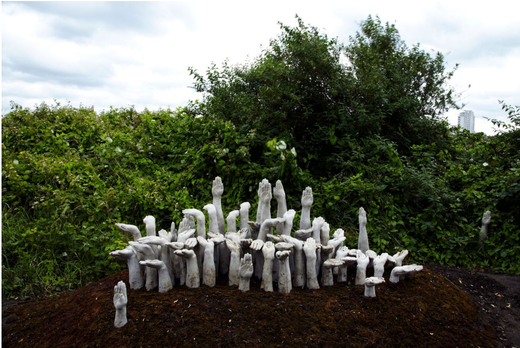
Zombie bench by George King Architects, 2012.