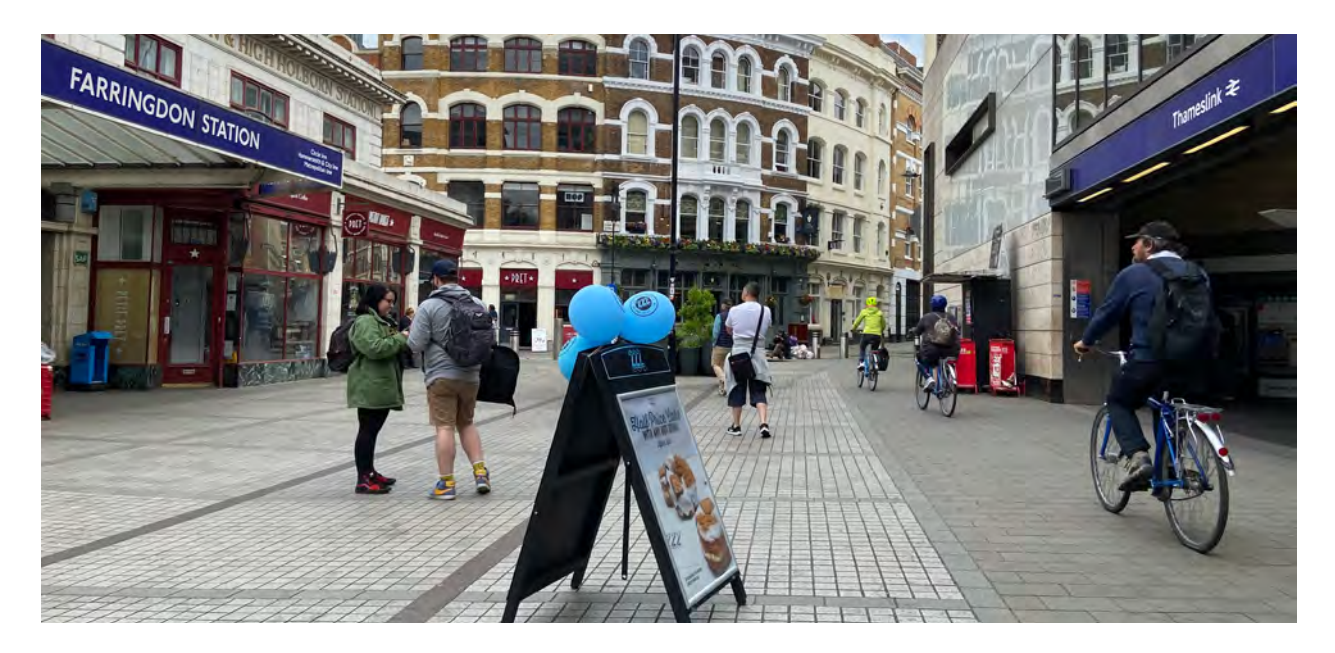
Image Description: The public space between Faringdon Undergroun exit and Farringdon National Rail Exit, a paved path with people, the camera looking towards Cowcross Street

1. If you are coming out of Farringdon Underground Exit (Metropolitan, Circle or Hammersmith and City) turn left out of the station and continue along the road. If you are coming out of Farringdon National Rail and Thameslink, turn right out of the station and continue along the road. The pavement and roads are flat and can be accessed easily.