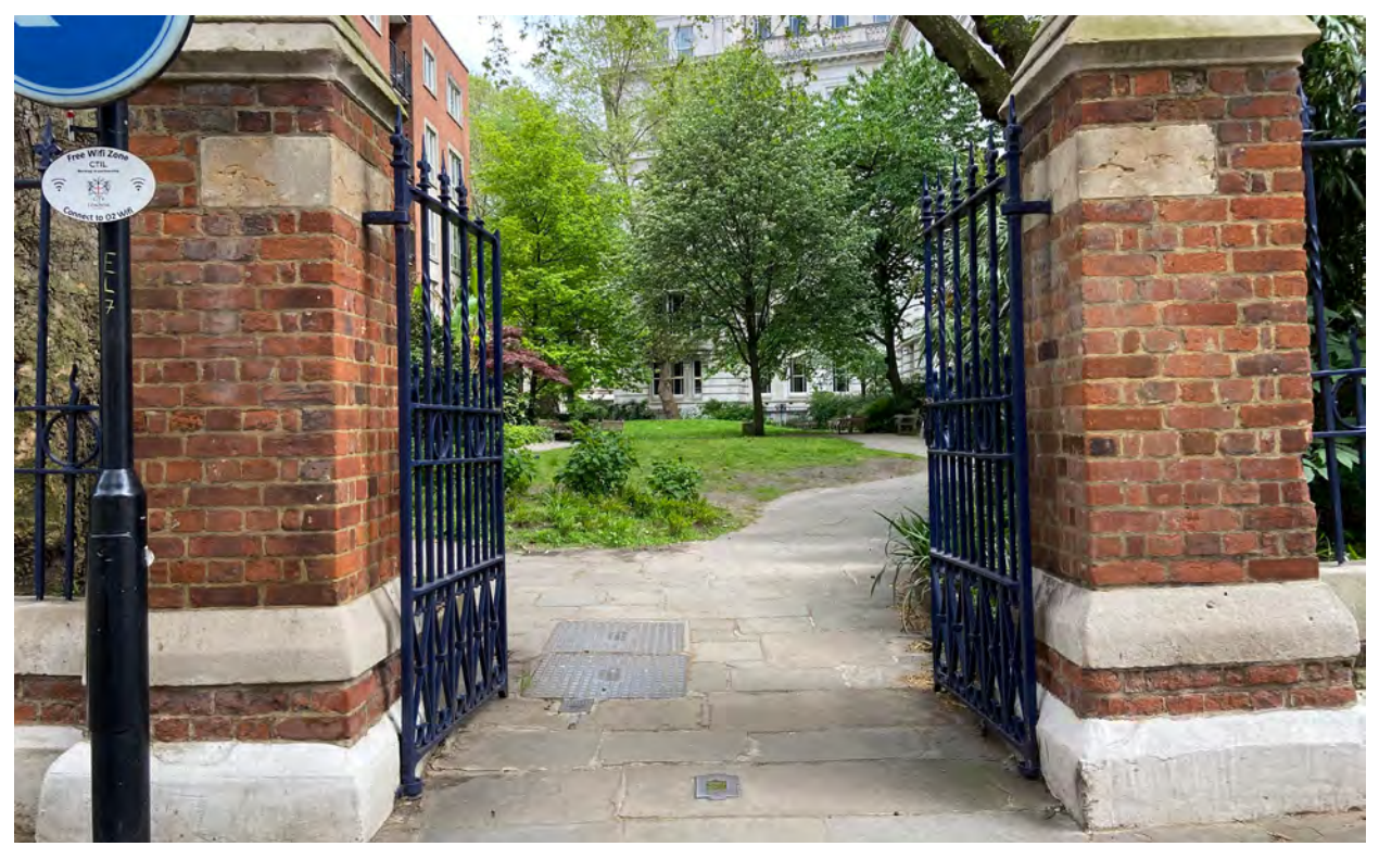
Image Description: Two brick pillars and an open black steel gate lead into Postmans Park.

7. On your right is a large entrance to St Barts hospital where there are accessible toilets. Opposite the entrance is a crossing, cross here to the other side of the road a go right.