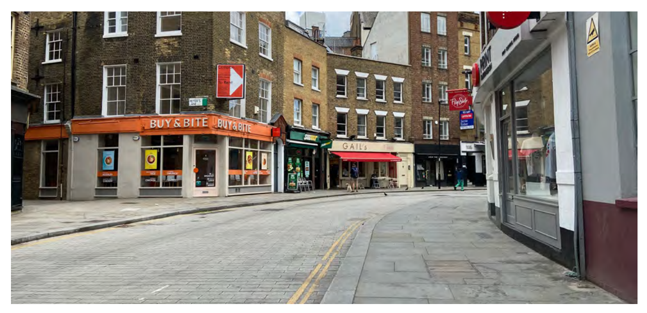
Image Description: Cowcross Street with the road curving round to the right and shops in the background

1. If you are coming out of Farringdon Underground Exit (Metropolitan, Circle or Hammersmith and City) turn left out of the station and continue along the road. If you are coming out of Farringdon National Rail and Thameslink, turn right out of the station and continue along the road. The pavement and roads are flat and can be accessed easily.