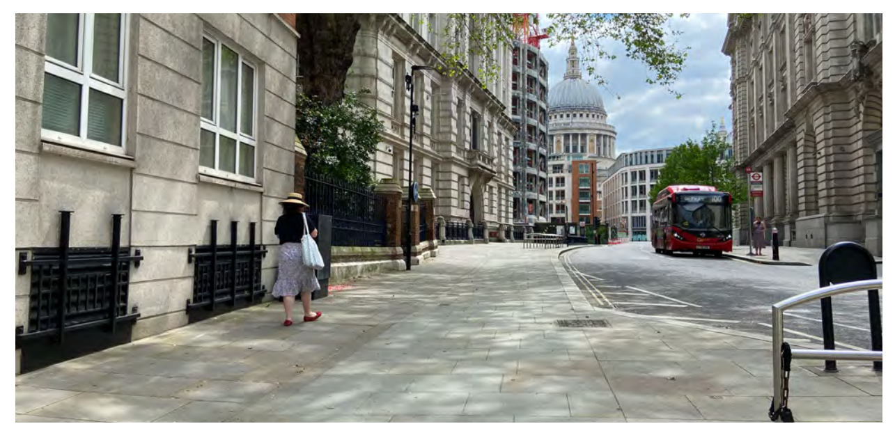
Image Description: A stone building is on the left and road the right, with a wide path straight ahead leading to the entrance to Postmans Park.

7. On your right is a large entrance to St Barts hospital where there are accessible toilets. Opposite the entrance is a crossing, cross here to the other side of the road a go right.