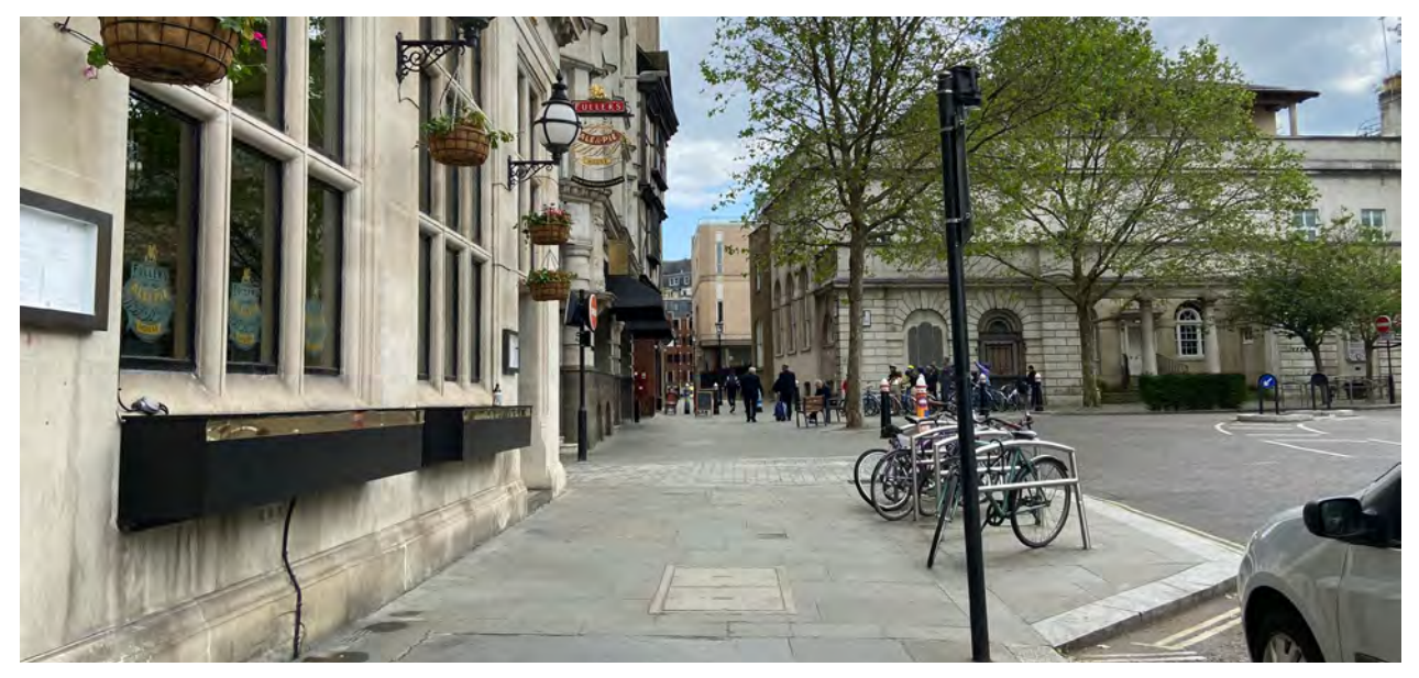
Image Description: A stone building is on the left and a collection of bikes to the right, straight ahead there is a slightly narrower path leading towards St Barts Hospital.

5. Continue along the road for about 150 metres. There are a few obstructions on the right side of the street. On your right you will find a few chairs which you may use to rest.