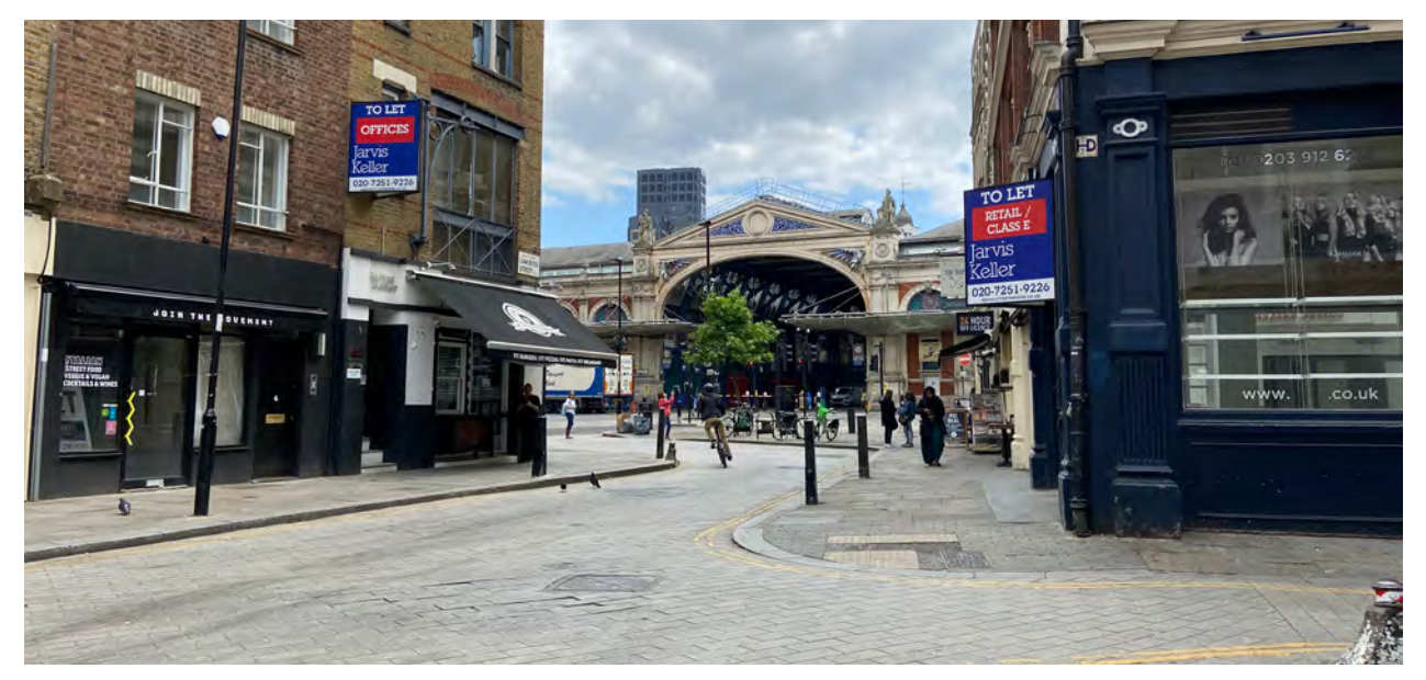
Image Description: Cowcross street turning left into a junction, there are shops either side and Smithfields Market in the background.

3. There is an affordable cafe on your right serving affordable food and drink. The road opens up onto a junction that can be busy and noisy at certain times of day. Cross at the accessible pedestrian crossing and continue along the road that goes through the large market building. This building is Smithfield Market. As an industrial market it is very busy at night but is quiet during the day.