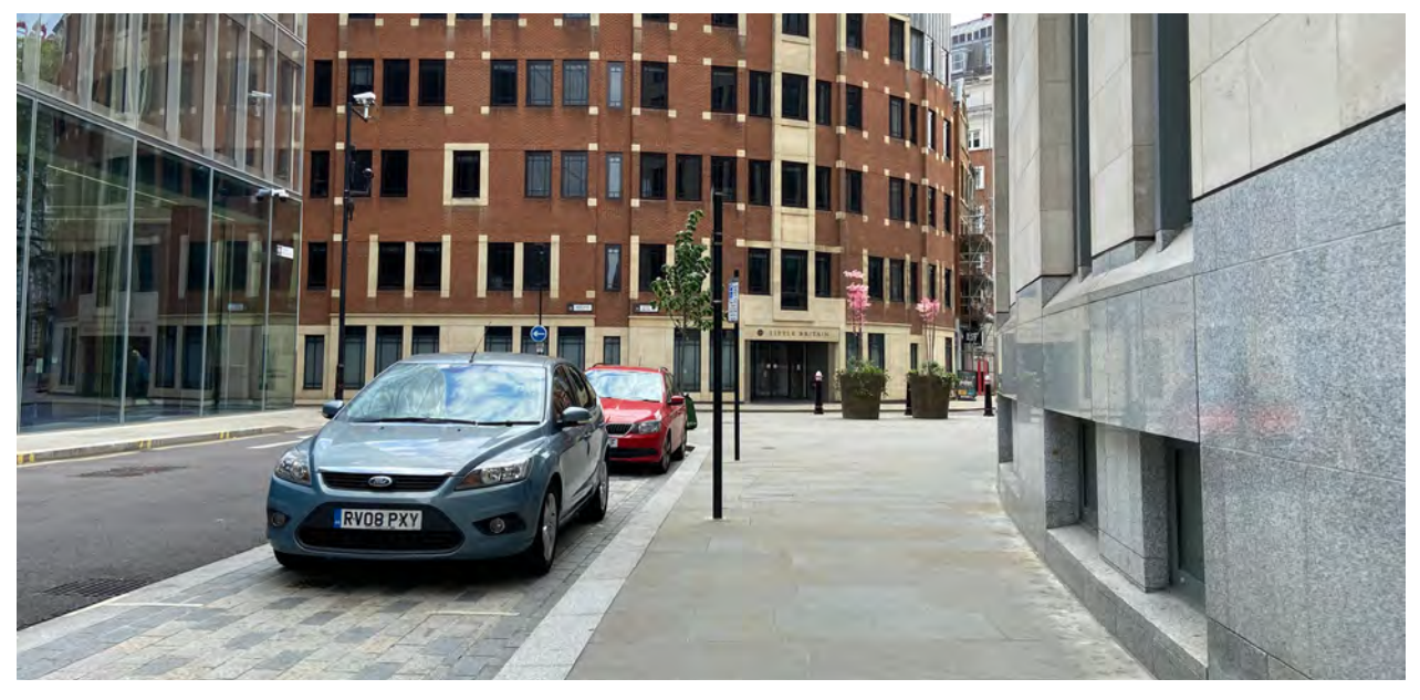
Image Description: A narrow path with parked cars on the left, a tall wall to the right, and a building straight ahead.

5. Continue along the road for about 150 metres. There are a few obstructions on the right side of the street. On your right you will find a few chairs which you may use to rest.