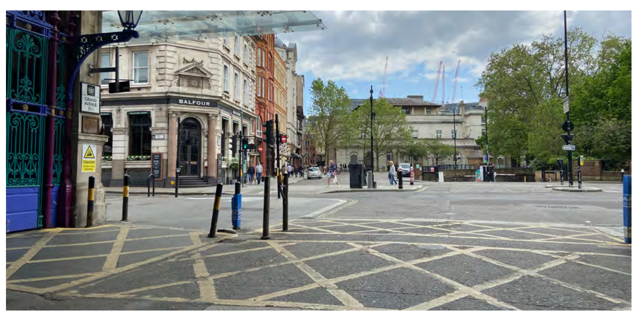
Image Description: The southern end of Smithfields Market, there are several bollards and a crossing to the left. There is a pub on the left and trees in the distance.

3. There is an affordable cafe on your right serving affordable food and drink. The road opens up onto a junction that can be busy and noisy at certain times of day. Cross at the accessible pedestrian crossing and continue along the road that goes through the large market building. This building is Smithfield Market. As an industrial market it is very busy at night but is quiet during the day.